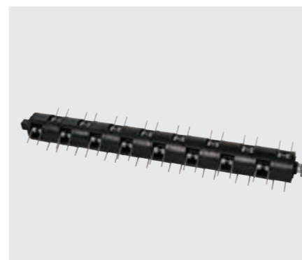
Scarifier Cassette (Model No: DY580-01) The optional scarifier is an extra to allow you to manicure your lawn.