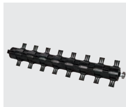
Brush Cassette (Model No: DY580-02) The optional brush aids in the lifting of wet leaves and debris.