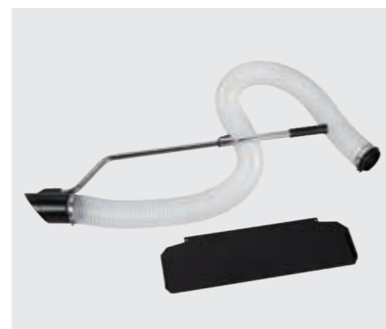
Vacuum Hose Kit (Model No: DY580-03) For hard to reach areas. The optional vac hose gives you extra reach so you can clean out areas where you can't get to with the front collector snout—garden beds, along foundations, window wells, etc. 250cm hose length. 730-990mm adjustable handle length. 90mm hose diameter.