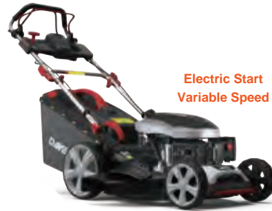
Electric Start Variable Speed